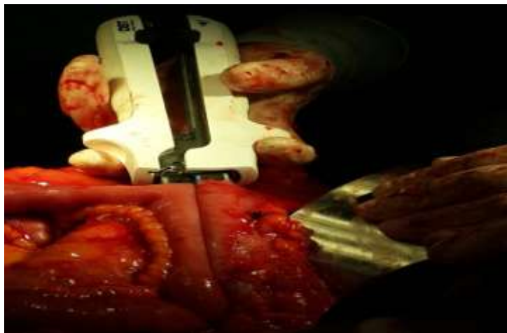
Figure 2- Stapler anastomosis with linear stapler

A total of 5 patients had other complications. Two patients in the hand sewn group and three patients in the stapler group. Complications include wound dehiscence, burst abdomen, pneumonia and myocardial infarction. All these patients were managed conservatively. There was no mortality in both the groups.